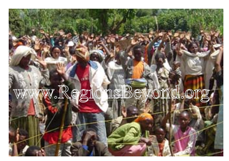
Thousands respond to gospel

Deep In The Horn Of Africa: It is often not easy to reach places where revival is taking place. Two days of driving led us a nondescript village located deep in the mountains and far removed from the amenities of modern life. Thousands of people walked up to twenty miles to attend the outdoor evangelism services. Life expectancy is forty nine years and falling and over twenty percent of children will not see their fifth birthday. In this setting people turn their hearts and hopes to eternal life.